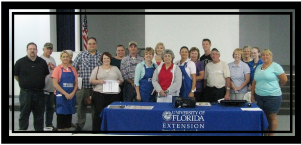
Meals on the Grill Extension team before the program in Jackson County.

love having a meal ready in 15 minutes”.