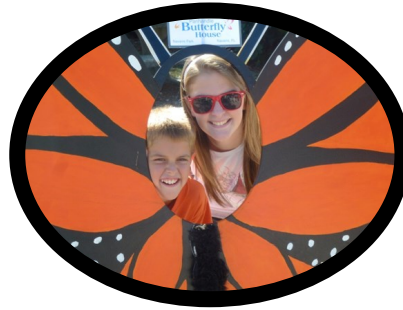
Enjoying the celebration of the Monarch Butterfly.

attendance. Monarch Madness is a part of the 10 th anniversary Beaches to Woodlands tour that showcases the treasures of Santa Rosa County every October.