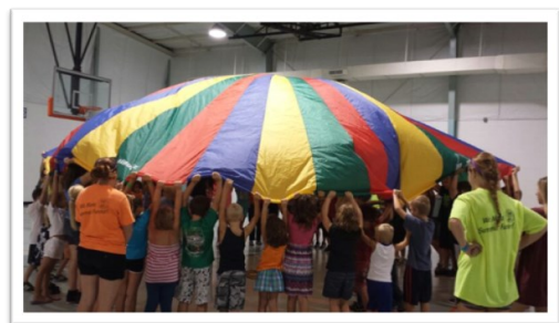
Second Visit "Fuel-Up for Fun with Healthy Snacks" - "popping Popcorn" parachute activity at Veteran's Memorial Park, Hudson

ancing calories with physical activity, their need to avoid excessive calories daily and the need to participate in at least 60 minutes of physical activity every day. That was put into practice with a heart-pounding, calorie-burning game of Food Group Fitness Tag .