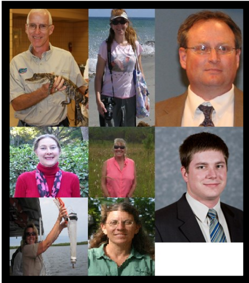
Members listed are in this photo from top to bottom, left to right.