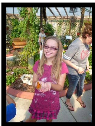
A young visitor releases a butterfly inside the vivarium.

varre County Park on Santa Rosa Sound. The county benefits economically from having a tourist attraction in its park. The county schools and other youth groups benefit from having a local educational venue for science-based field trips. The Panhandle Butterfly House opens for the season in late April and closes at Labor Day. It is open to the public Thursday through Saturday with scheduled tours Monday through Wednesday. In a typical year more than 12,000 visitors learn about the biology of butterflies, their role as pollinators, and their importance to the ecosystem. Most of the visitors are local residents but many are tourists from other states and countries; in a typical year the butterfly house has visitors from 10 different countries.