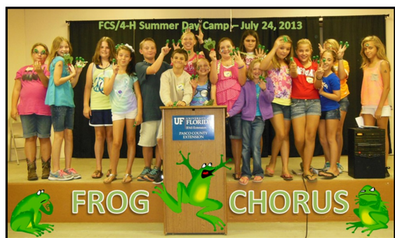
Frog Chorus youth participants.

On July 24, 2013, 21 youth attended a day-long FCS/4-H summer camp encouraging them to go “Back-to-Basics.” A group of 12 adult volunteers (including four from Home and Community Education – Fort Dade Club) eagerly joined in to share games, stories, and foods of their younger days with Pasco youth aged 8 to 12, making this a truly inter-generational event.