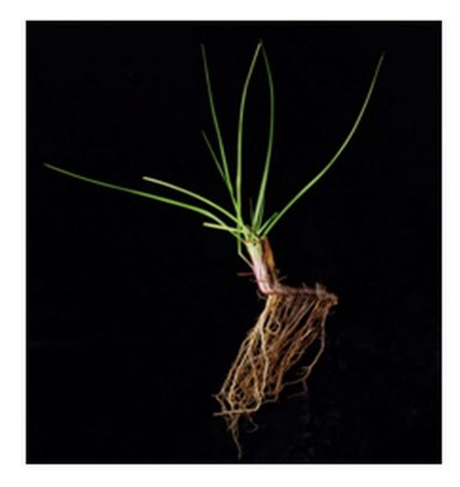
Figure 1. Bahiagrass plug

Bahiagrass forms an extensive, deep root system. It sustains better than other grasses in infertile, sandy soils and does not require high inputs of water or fertilizer. This makes it a good choice for home sites on large lots or acreage or for anywhere that there is no irrigation system. Bahiagrass prefers acidic soils, such as those found in the central area of much of the state. It does not form excessive thatch. It may be grown from seed, which is abundant and relatively cheap, but may take some time to germinate and provide cover. It may also be established from sod.