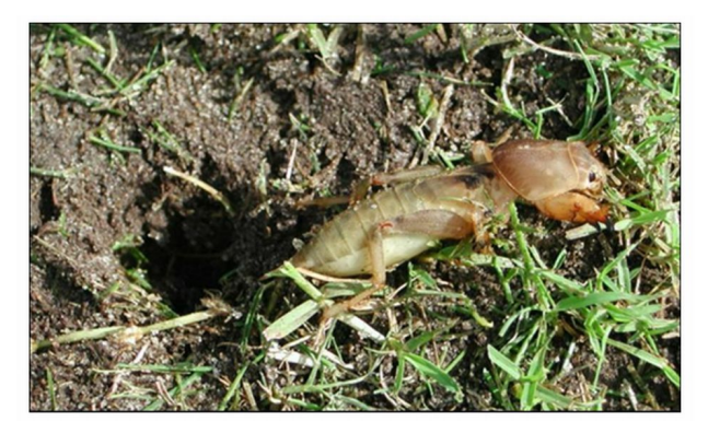
Figure 4. Mole cricket

The most serious insect threat to bahiagrass is the mole cricket (Figure 4). These insects burrow though the soil and damage roots, causing the grass to wilt rapidly. Check for mole crickets by looking for their tunnels and mounds or by applying 2 gallons of water with 1–2 ounces of detergent soap per 2 square feet of turf in suspected damaged areas. If present, the mole crickets will surface in a few minutes.