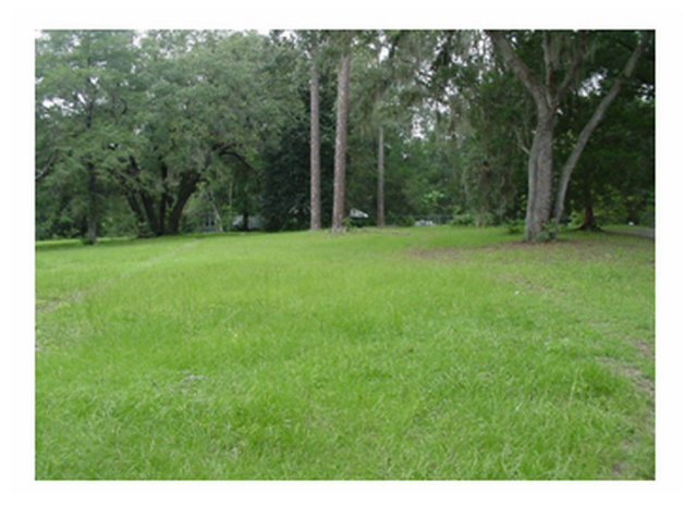
Figure 2. A low-maintenance bahiagrass lawn with seed heads visible.