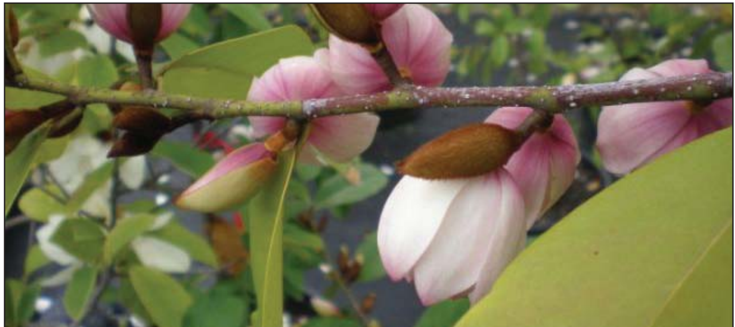
2012 Agricultural Innovator