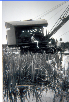
~1927 Draining the Everglades