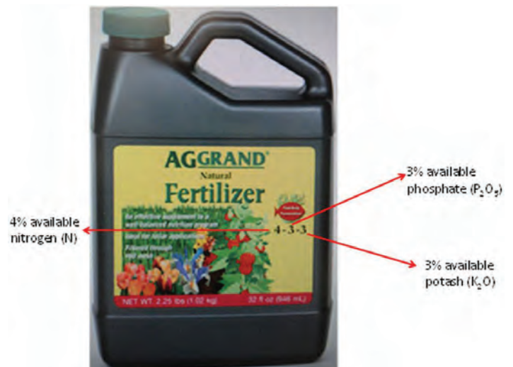
Figure 4. A 4-3-3 liquid fertilizer label. This 1 quart of liquid fertilizer has 0.09 pounds (41 grams) of nitrogen (N) and 0.07 pounds (31 grams) each of phosphorus ( P_2O_5 ) and potassium ( K_2O ). Namely, it has 0.23 pounds (103 grams) of active ingredients and 2.02 pounds (917 grams) of water or other inactive ingredients.