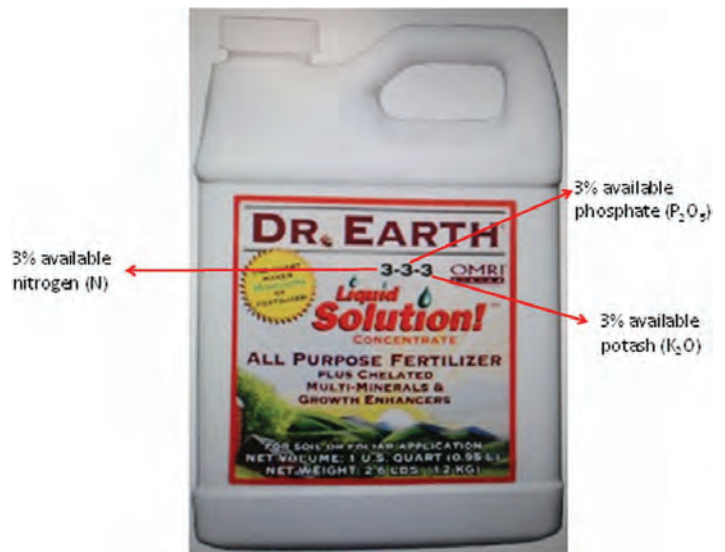
Figure 3. A 3-3-3 liquid fertilizer label. This 1 quart of liquid fertilizer has 0.08 pounds (36 grams) each of nitrogen (N), phosphorus ( P_2O_5 ), and potassium ( K_2O ) active ingredients. Namely, it has 0.24 pounds (108 grams) of active ingredients and 2.4 pounds (1092 grams) of water or other inactive ingredients.

Dr. Earth® has a lower percentage of active ingredients but greater density than AgGrand®. Dr. Earth® has 9% active ingredients in total (3% each for N, P_2O_5 , and K_2O ), and its density is 10.51 pounds per gallon (Figure 3). Its total active ingredients per quart are 0.24 pounds. AgGrand® (Figure 4) has a greater percentage (4% + 3% + 3% = 10%) of active ingredients in total but lower density (9.01 pounds per gallon) than Dr. Earth® (10.51 pounds per gallon). Therefore, the former has more active ingredients (0.24 pounds) than