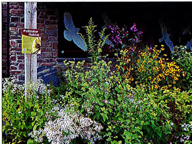
Figure 9 Newly-planted areas should be clearly marked to protect them from herbicides or other disturbances (left). Using signs such as the one on the right can be a useful tool to designate protected pollinator habitat. (Note: Due to wildlife safety concerns, we recommend attaching habitat signs to the top hole of the fence post or plugging the top hole with a bolt and nut. Alternatively, posts which do not have holes—such as solid wood stakes—should be used.)