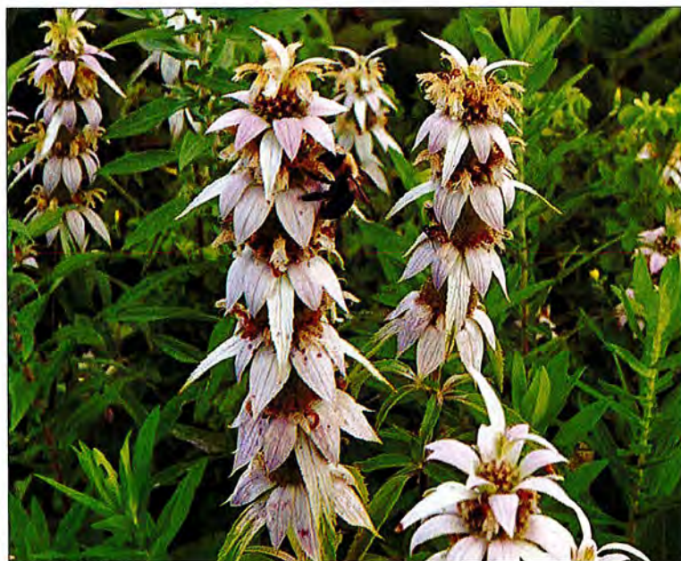
Figure 13 Dotted horsemint ( Monarda punctata )—often referred to as “beebalm”—is a member of the mint family that attracts various pollinators, especially bumble bees, in late summer and early fall.