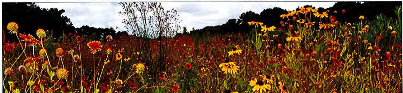
Figure 1 Plant selection should focus on pollen and nectar-rich native plants as much as possible—include non-invasive, non-native plants when cost and/ or availability are limiting factors—with a mix of plants to ensure consistent and adequate floral resources through the seasons, like this pollinator planting in South Carolina.