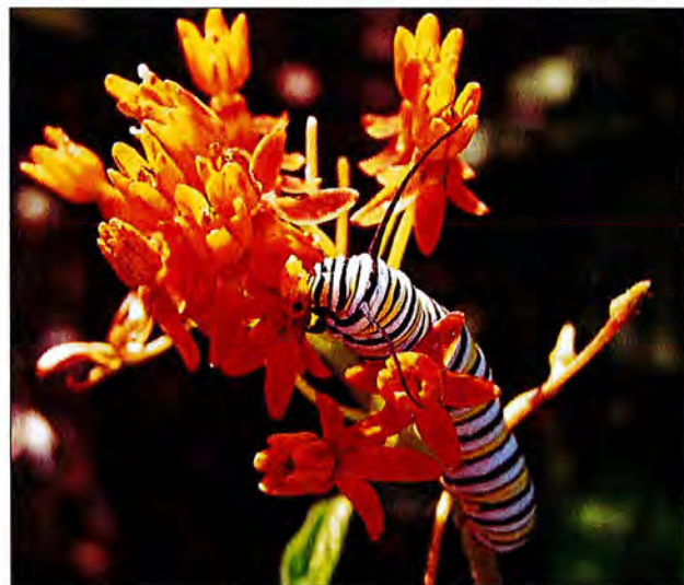
Figure 16 Milkweed ( Asclepias spp.) is the host plant for the monarch butterfly, which feeds exclusively on milkweed as a caterpillar—shown left, on butterfly milkweed ( Asclepias tuberosa ). On the right, native bees forage on swamp milkweed ( Asclepias incarnata )—which is only found in southern parts of Florida.