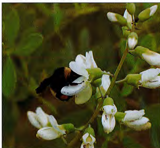
Figure 14 Many species of native legumes are excellent pollinator plants that also attract a variety of beneficial insects and wildlife. White wild indigo ( Baptisia alba ), left, and wild lupine ( Lupinus perennis ), right, are two early-blooming examples that provide forage at the beginning of the season while enriching the soil.