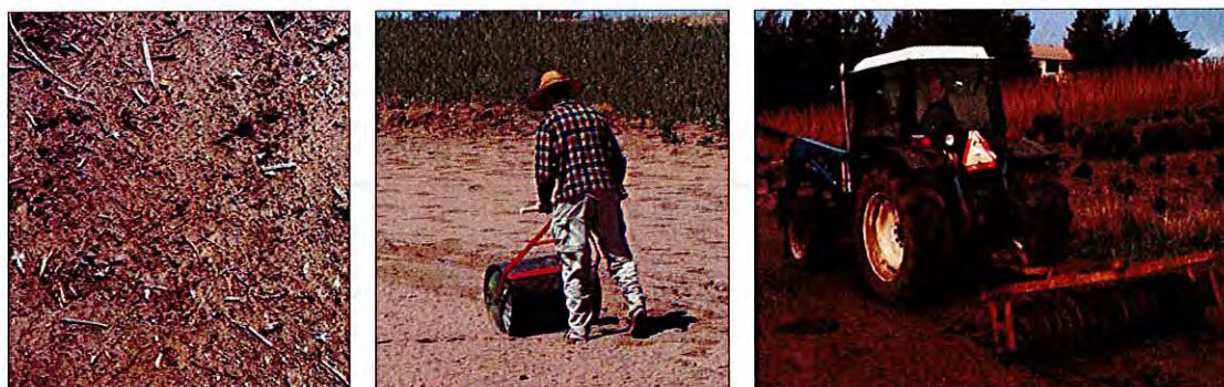
Figure 4 Native wildflower seed should be planted directly on the soil surface (left). After broadcasting, roll the site with a turf roller (middle) or cultipacker (right).