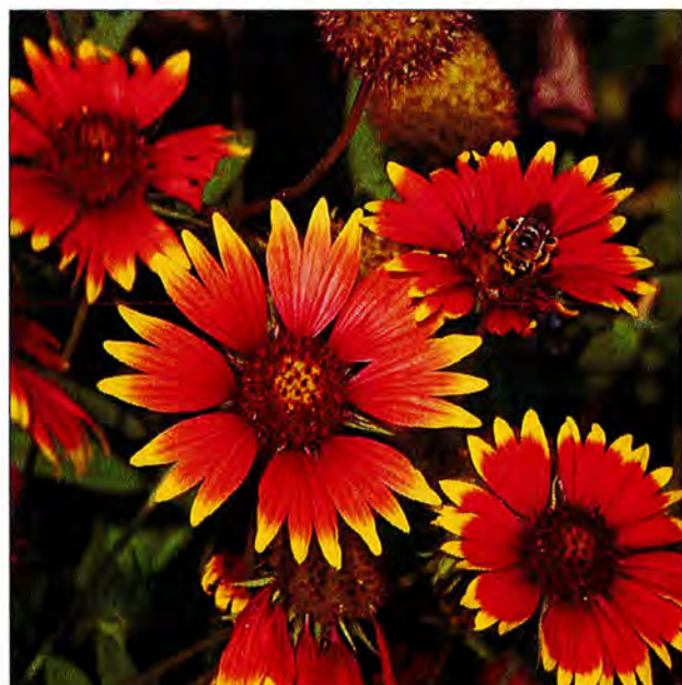
Figure 12 Blanketflower ( Gaillardia pulchella ) is a great early season resource with a long bloom period that supports different pollinators—including sunflower (left) and many other native (right) bees—in addition to beneficial insects. A hardy and attractive plant, it can also be harvested and sold as cut flowers.