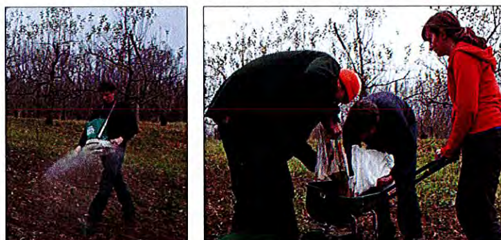
Figure 5 Hand-crank "belly grinder" type seeders (left) are inexpensive and can broadcast seed more evenly than hand-scattering on larger sites. Similarly, lawn fertilizer spreaders (right) are another commonly available tool for broadcasting seed. In both cases, models with internal agitators are preferred to prevent clogging. For best results, divide the seed into separate batches, grouping seed of similar sizes for planting together with the flow gate adjusted accordingly.