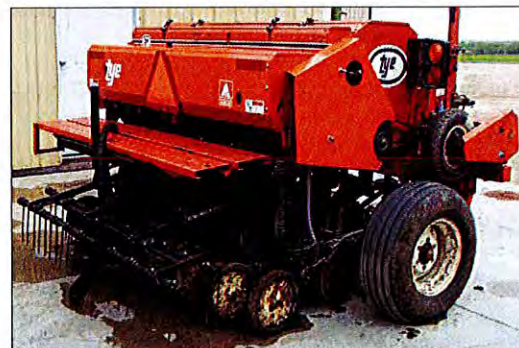
Figure 6 Native seed drills are the ideal tool for large planting sites (5+ acres). Typical models can plant in a light stubble layer, have depth controls for optimal seed placement, and have separate seed boxes for different sizes of seed. Such drills need an experienced operator and careful calibration.