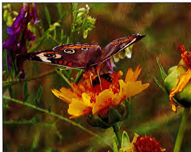
Figure 10 Native to North (N) and Central (C) Florida (and most of the U.S.), lanceleaf tickseed ( Coreopsis lanceolata ), attracts a variety of pollinators. Below, a buckeye butterfly and sweat bee share a single bloom.