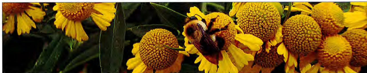
Bumble bee on common sneezeweed ( Helenium autumnale ).