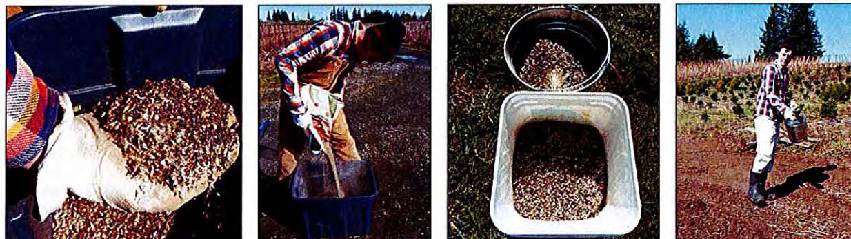
Figure 3 For broadcast seeding, seed of similar size is mixed together (left). Sand or another inert carrier is added (at a ratio of at least 2:1) and then mixed (middle left), and the mix is divided into separate batches (middle right) for broadcasting in more than one pass (to ensure adequate coverage). When hand-broadcasting seed, walk in perpendicular passes over the entire planting area (right).