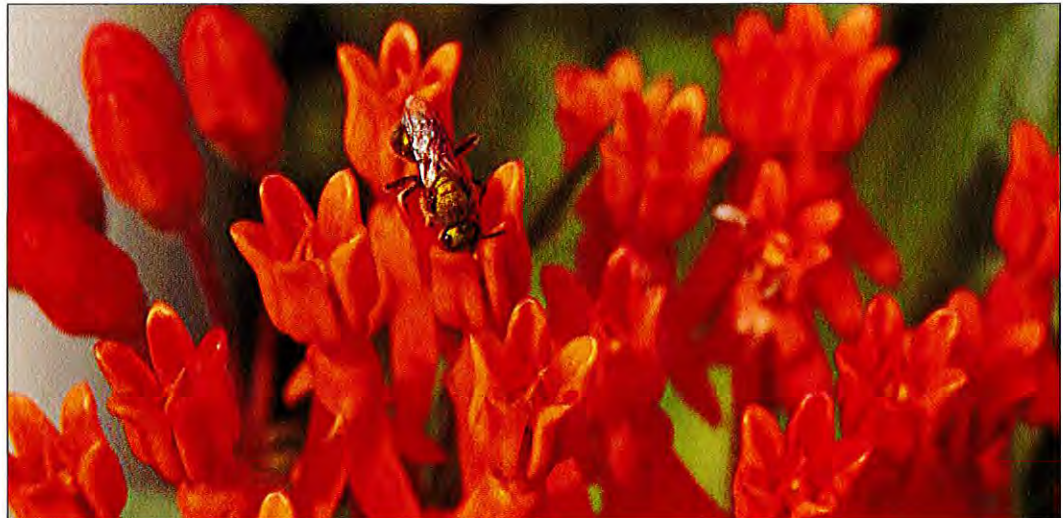
Native bee on butterfly milkweed ( Asclepias tuberosa).

We thank the photographers who generously allowed use of their images. Copyright of all photographs remains with the photographers. None of the photographs may be reproduced without permission from the photographer. If you wish to contact a photographer, please contact the Xerces Society at the address below.