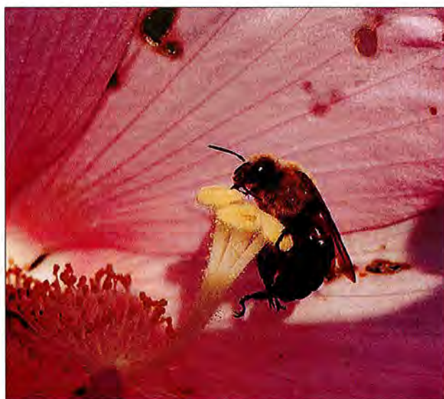
Figure 15 Eastern rosemallow ( Hibiscus moscheutos ) supports the specialist hibiscus bee ( Ptilothrix bombiformis ), a species that is native to the eastern U.S.