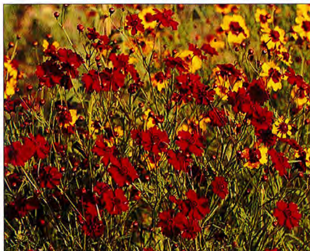
Figure 11 Goldenmane tickseed ( Coreopsis basalis ) and golden tickseed ( Coreopsis tinctoria ), are non-natives, occurring naturally in the southern U.S. and west of Florida. They are non-invasive, commonly planted due to their ease of establishment and low-cost seed.