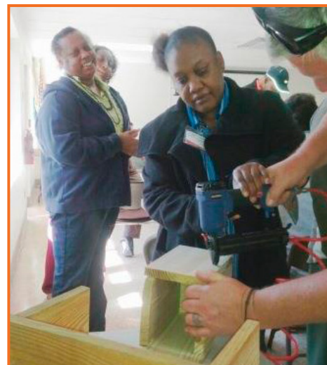
Master Gardeners helped CARC participants experience all phases of the construction process.