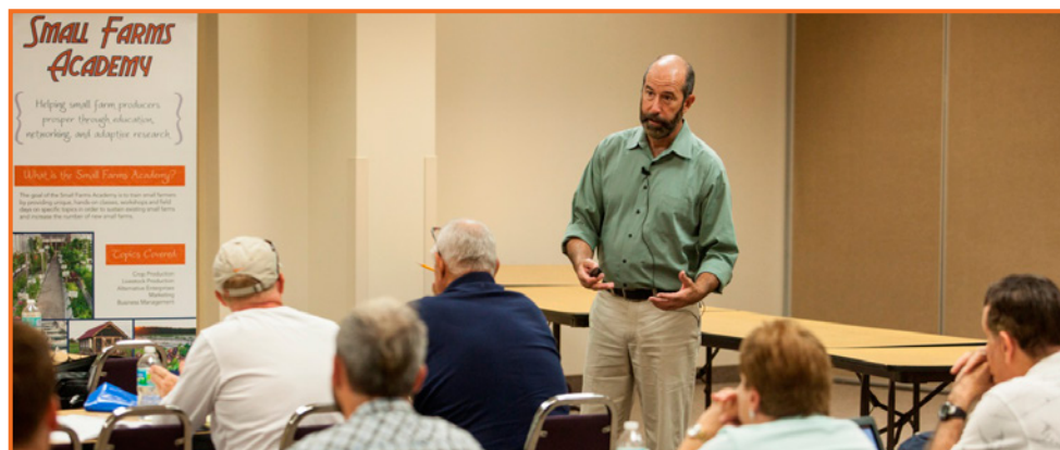
Methods of delivery are guided by learning objectives at the 2014 Small Farm Conference.