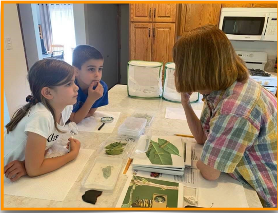
A lesson for some neighborhood children on the Monarch butterfly life cycle.