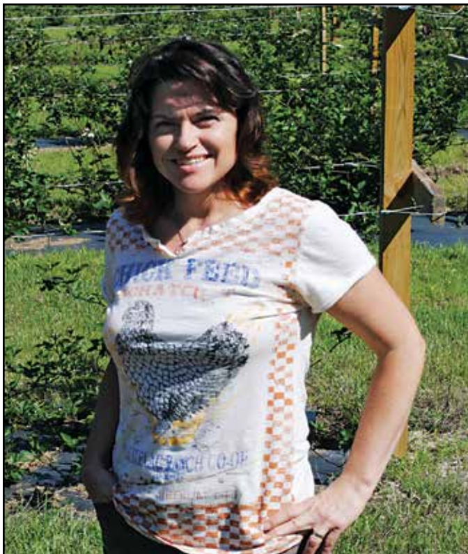
Northwest Florida Extension District